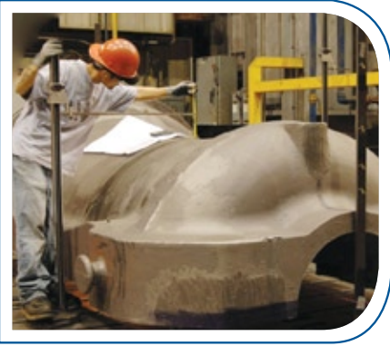
Large steel turbine housing