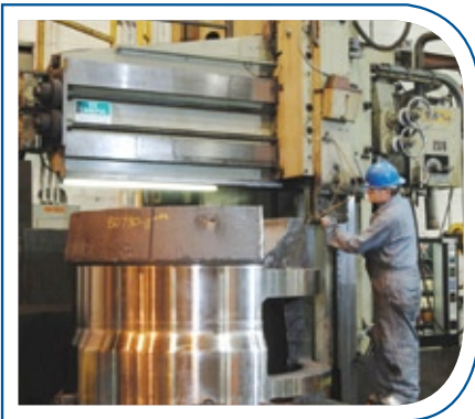
Turning/Machining (Off-shore Oil Platform Riser Basket)