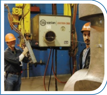
Linatron Radiography for Heavy Sectioned Castings