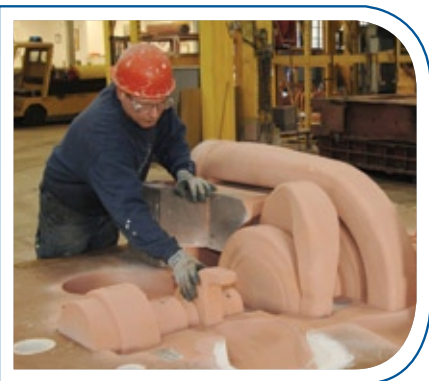
Molding/core making (complex pump housing)