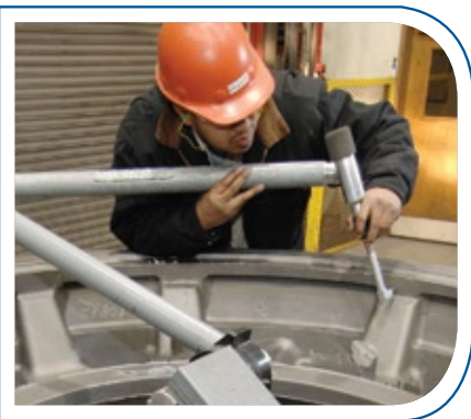
Highly Engineered Energy Component